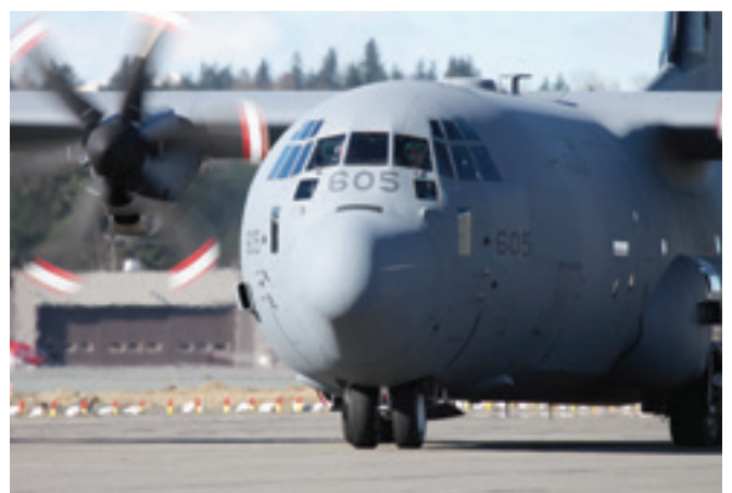
Front Cover Images: Top right: HNZ Topflight Bottom left: MDA Corporation Bottom right: Coulson Aviation