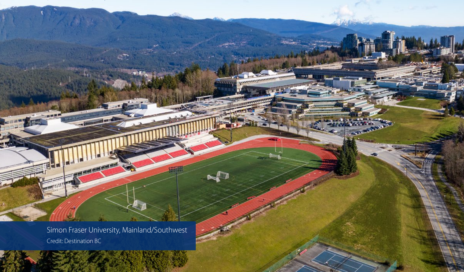
Simon Fraser University, Mainland/Southwest

British Columbia is a magnet for top talent worldwide, supported by 25 colleges and universities including the University of British Columbia and the second-largest concentration of international students in Canada. With a majority of employees holding post-secondary education and immigration programs that provide access to specialized international workers, the province offers a strong and diverse talent pool for employers.