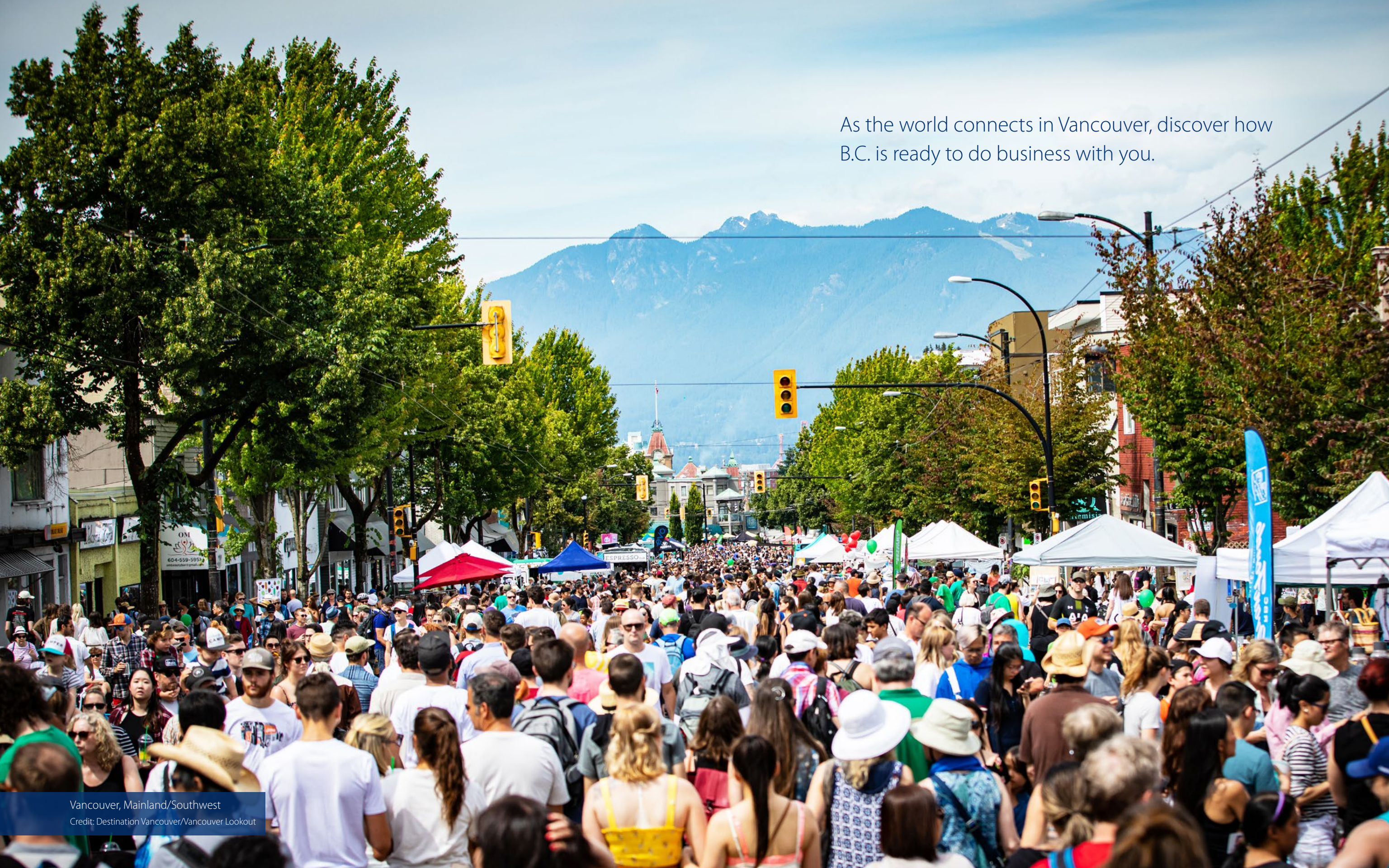
Vancouver, Mainland/Southwest

As the world connects in Vancouver, discover how B.C. is ready to do business with you.