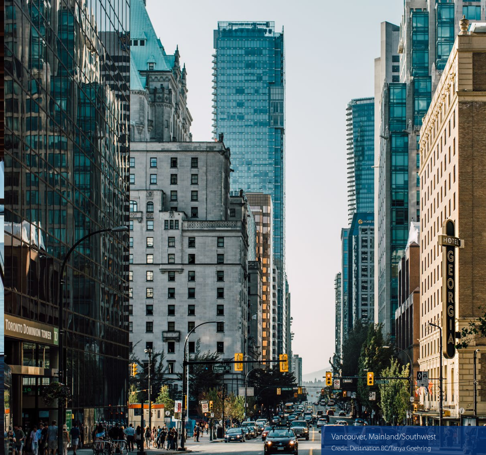
Vancouver, Mainland/Southwest

Access opportunities worldwide through a global network of Trade and Invest BC Representatives in more than 20 major cities across North America, Europe and Asia. Connect with an expert near you, or on BritishColumbia.ca .