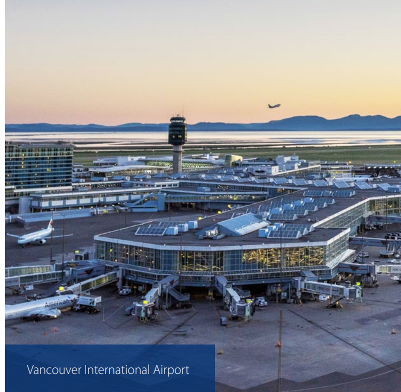
Vancouver International Airport

British Columbia's west coast location connects businesses globally, supported by the Port of Vancouver, Canada's largest, and the Port of Prince Rupert, the closest North American port to Asia. The province has 36 certified airports including six international, along with 30 border crossings to the U.S. and extensive rail and road networks.