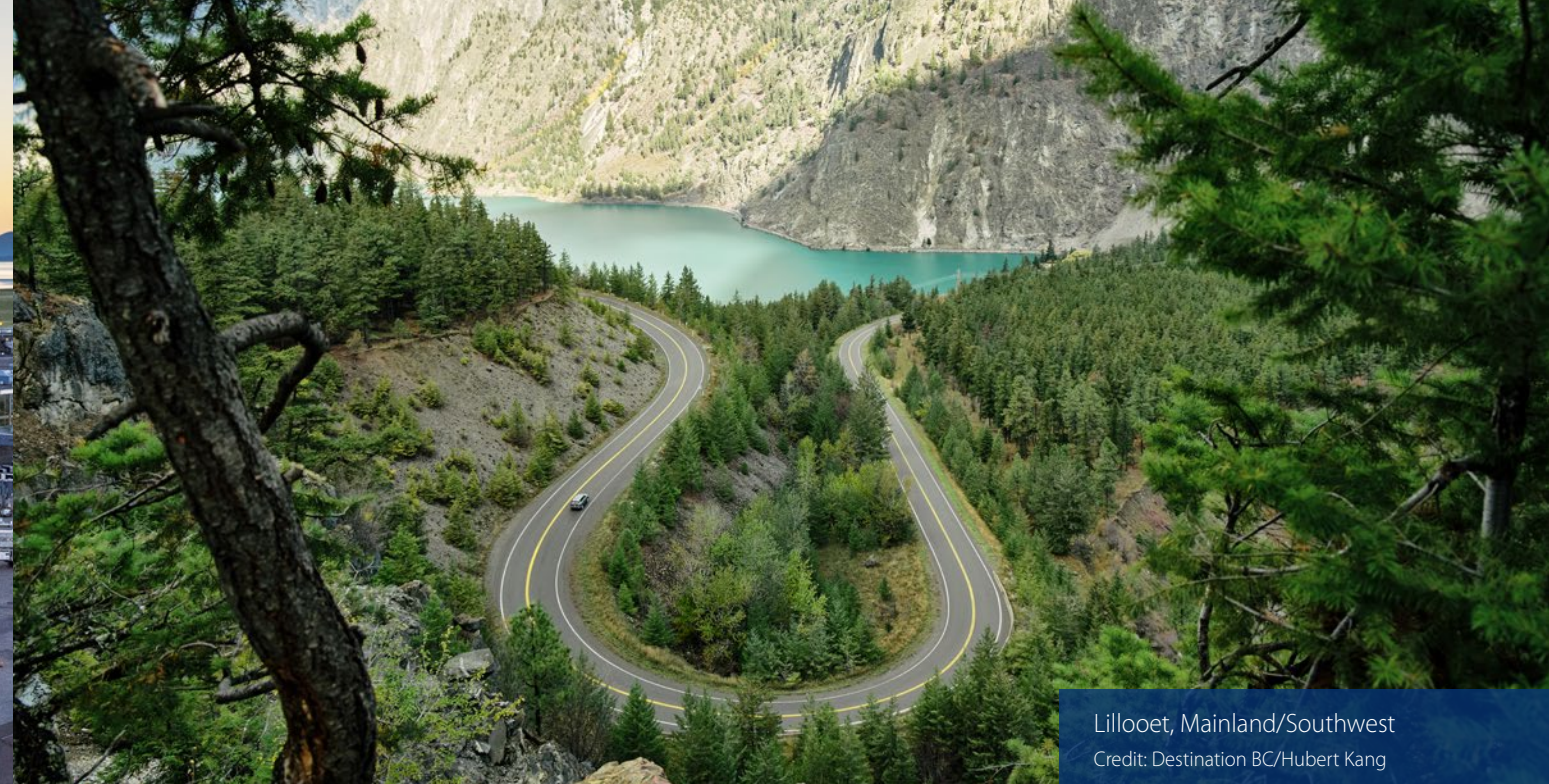
Lillooet, Mainland/Southwest