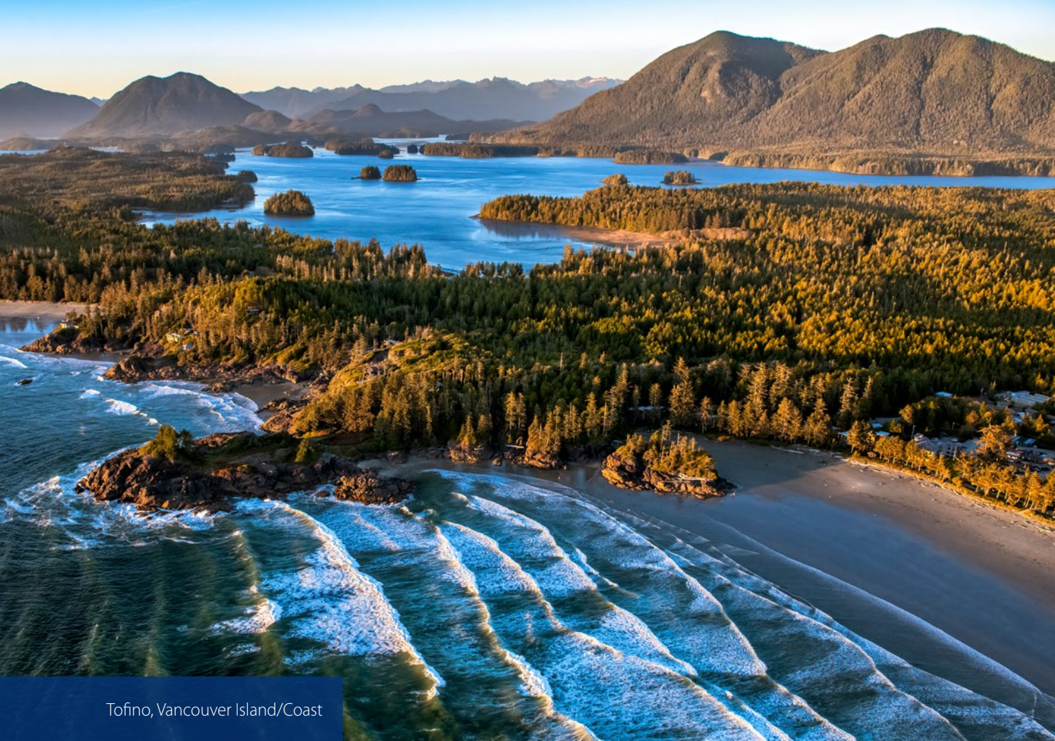
Tofino, Vancouver Island/Coast