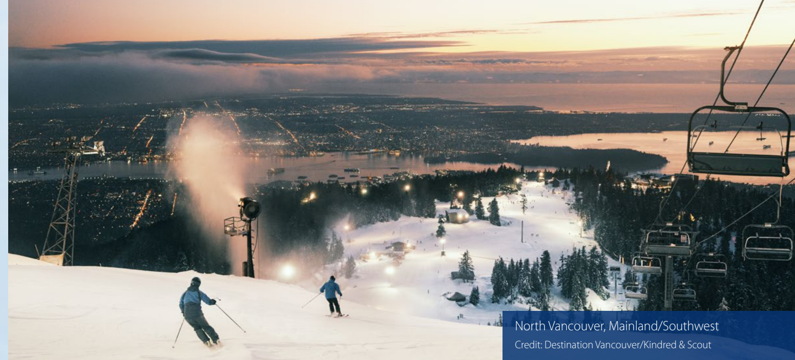
North Vancouver, Mainland/Southwest

British Columbia offers a lifestyle that attracts talent and investment, with Vancouver consistently ranked among the world's most livable cities and supported by an excellent public healthcare system. It is a world-class destination, with tourism standing as one of the province's most dynamic industries and a powerful driver of economic growth and opportunity. Residents and visitors also enjoy unmatched access to outdoor recreation, from oceanfront trails to world class mountains.