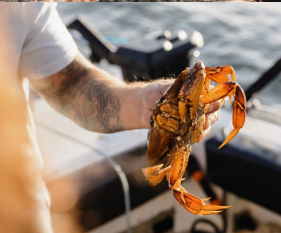
Prince Rupert, North Coast