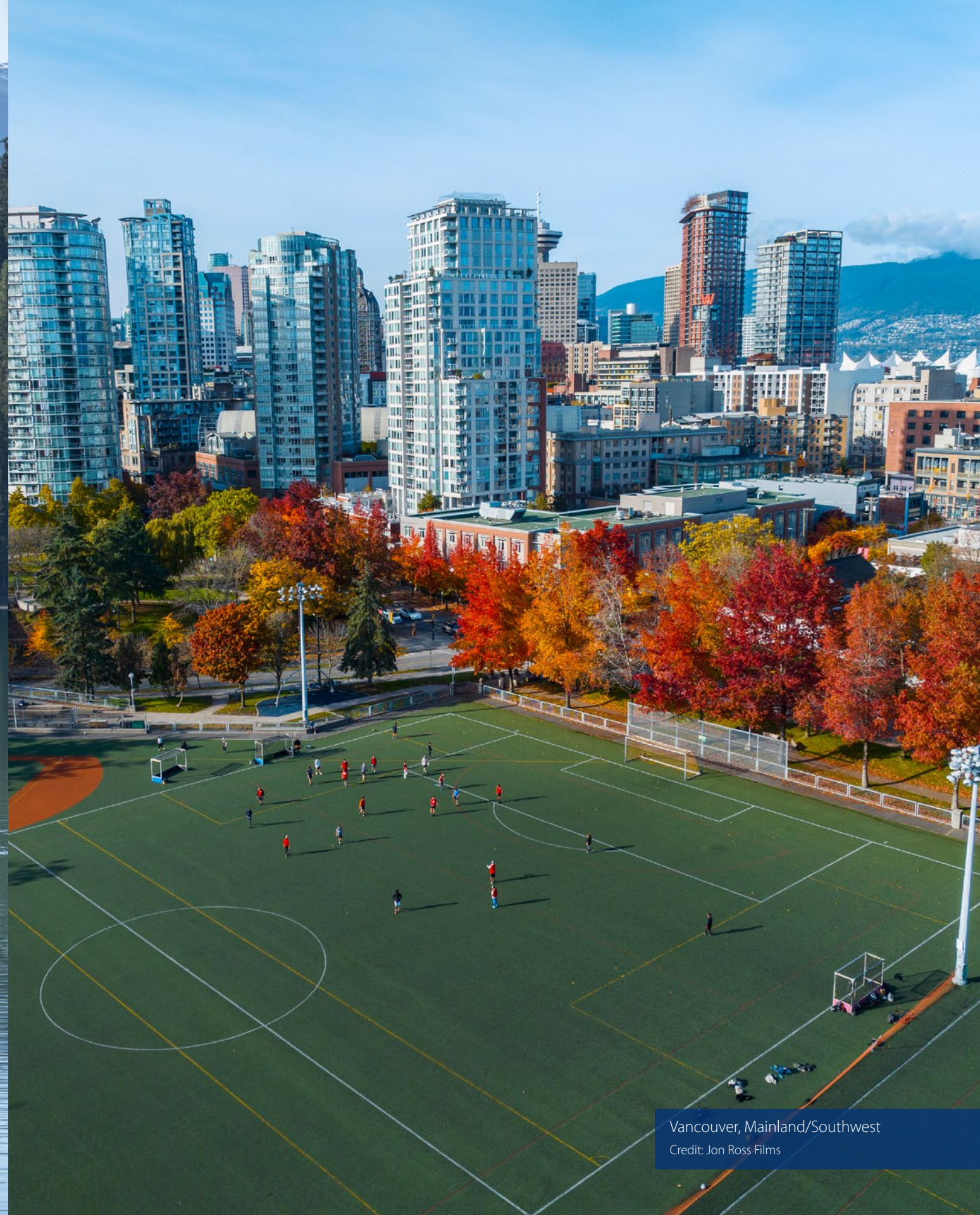
Vancouver, Mainland/Southwest