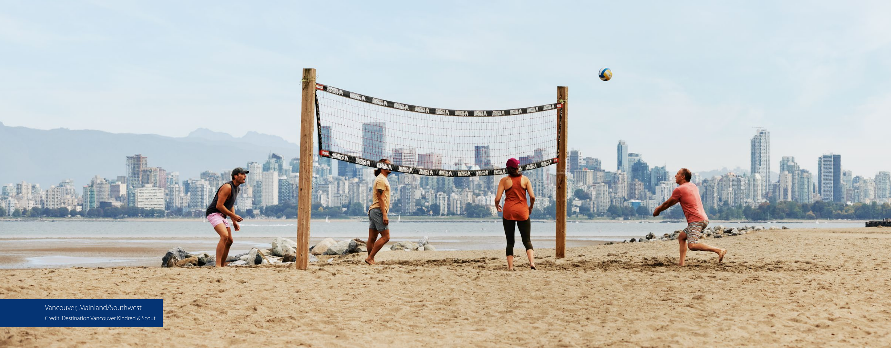
Vancouver, Mainland/Southwest