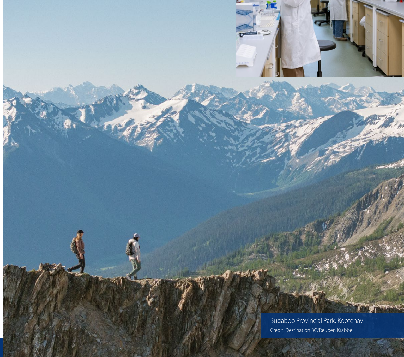
Bugaboo Provincial Park, Kootenay