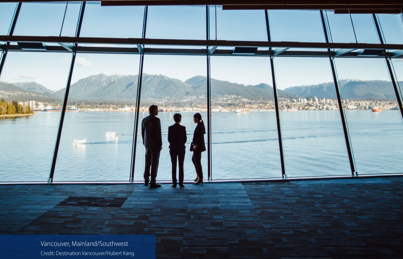
Vancouver, Mainland/Southwest