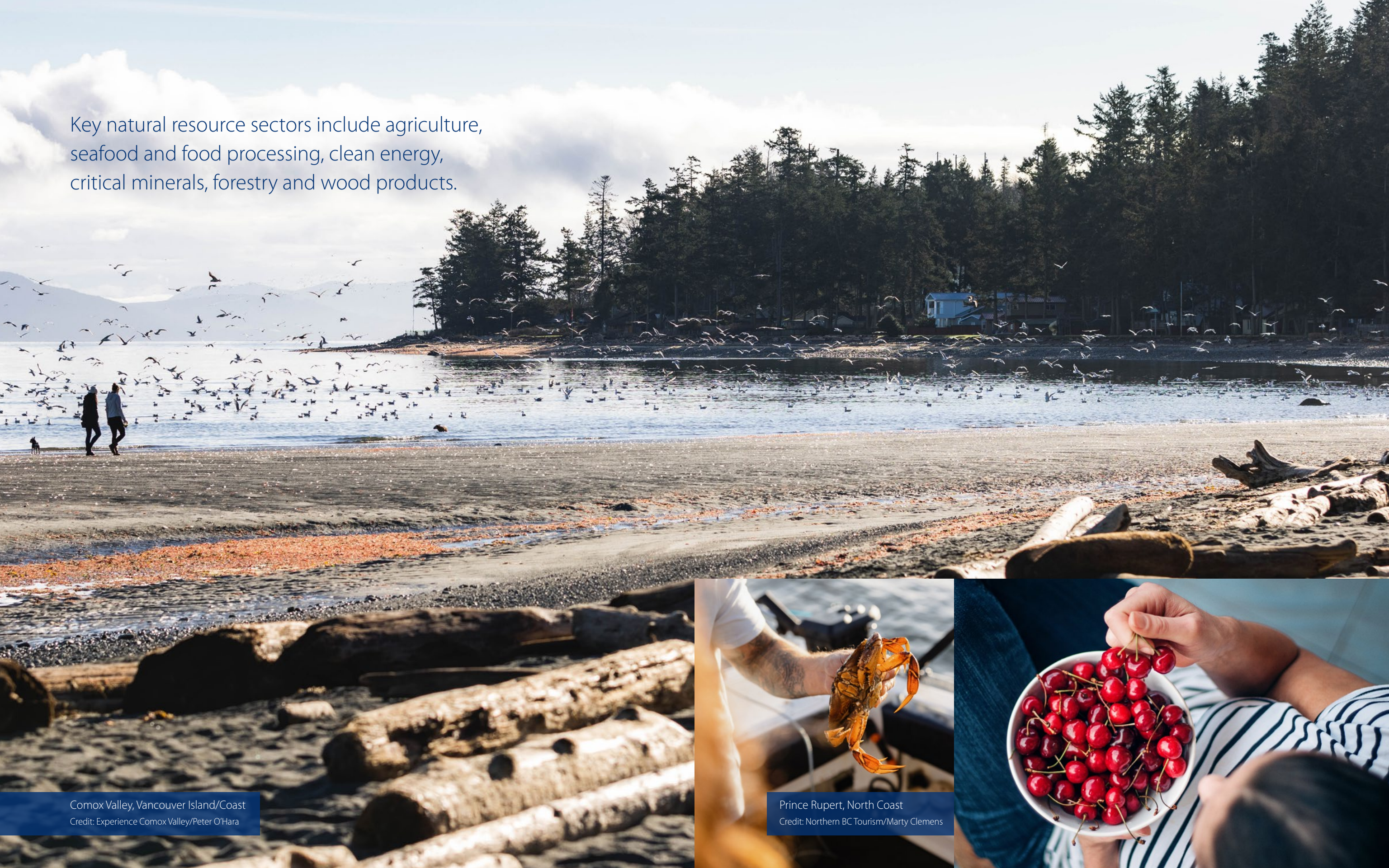
Comox Valley, Vancouver Island/Coast

Key natural resource sectors include agriculture, seafood and food processing, clean energy, critical minerals, forestry and wood products.