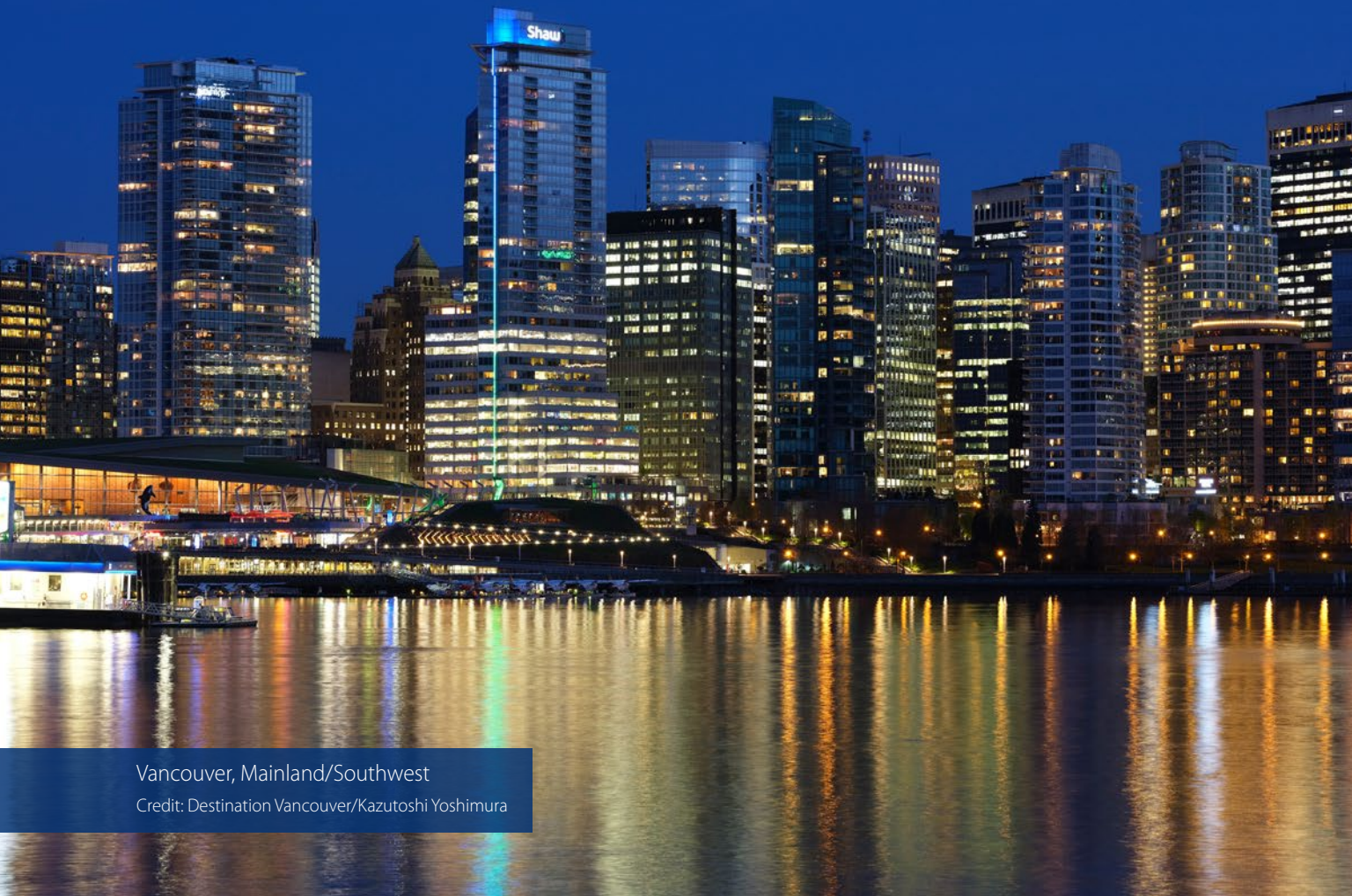
Vancouver, Mainland/Southwest